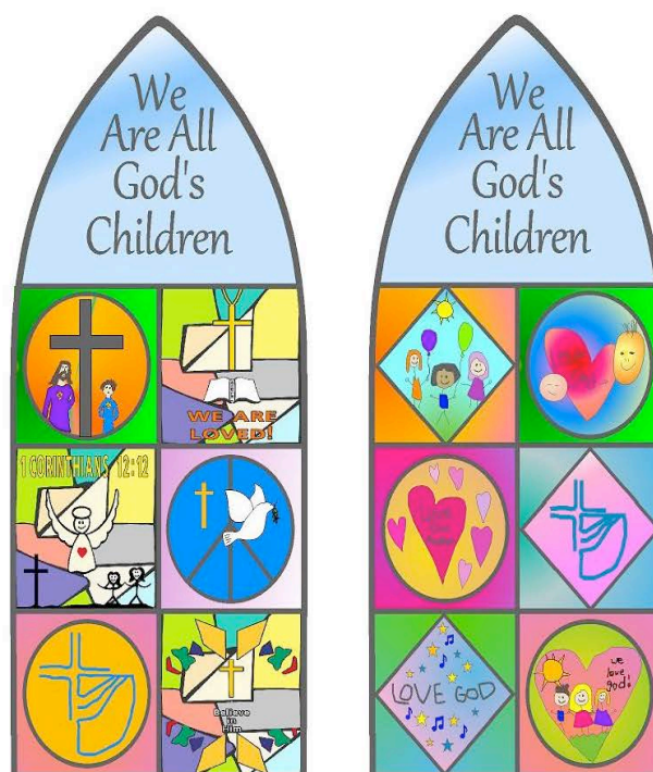
Left window panel drawings submitted by the children of the Manassas and Fairview congregations. Right window panel drawings submitted by the children of the Friendship congregation.

If anyone would like to be a delegate please contact Danny Rumpf at djrumf78@comcast.net .