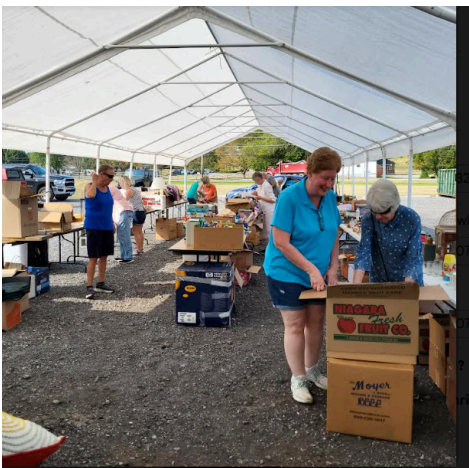
Before the Storm