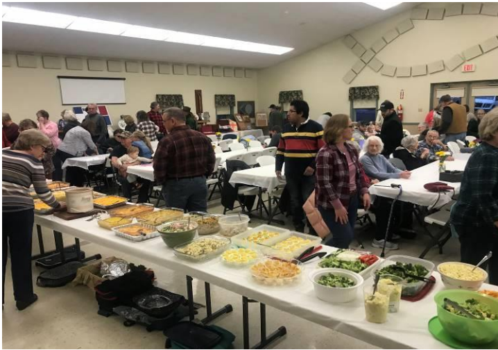
Pig Roast and Silent Auction