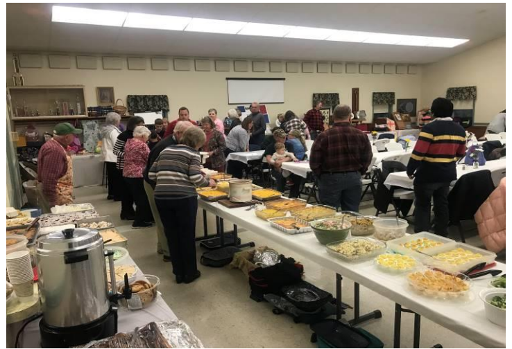
Outreach Preparing Food and Making Blankets